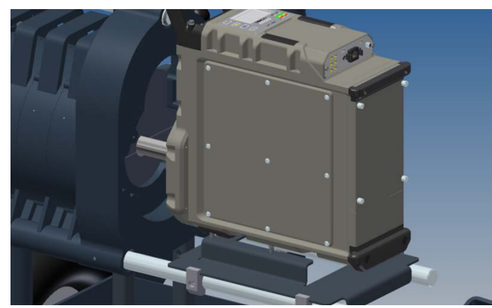
Aegis spectrometer mounted on any Canberra ISOCS cart